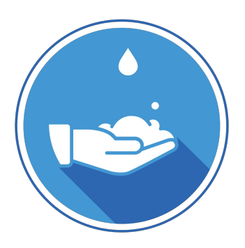
Regularly practice handwashing.