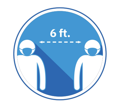
Keep at least six feet of distance from people not in your household.