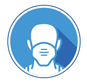
Wear a face mask or appropriate face covering in public.

City employees represent more than themselves, and should model best practices for all Angelenos, even when off-duty. Encourage employees to adhere to City, County and State health orders, and to follow public health precautions recommended by the Centers for Disease Control and Prevention: